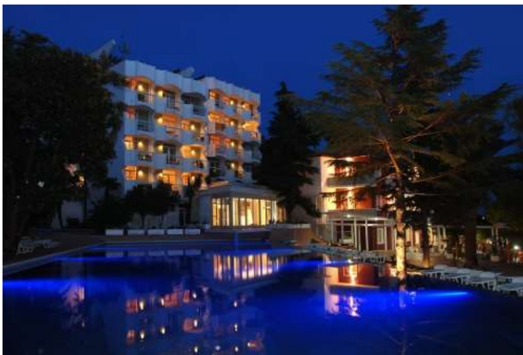
Hotel Sun Resort