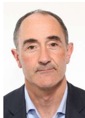
Luis M. Liz-Marzán