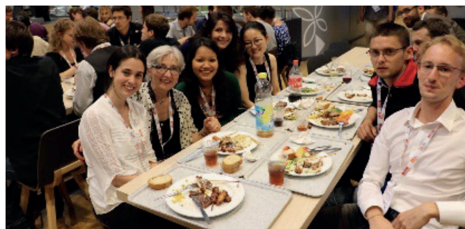
The barbecue evening on the EPFL Campus