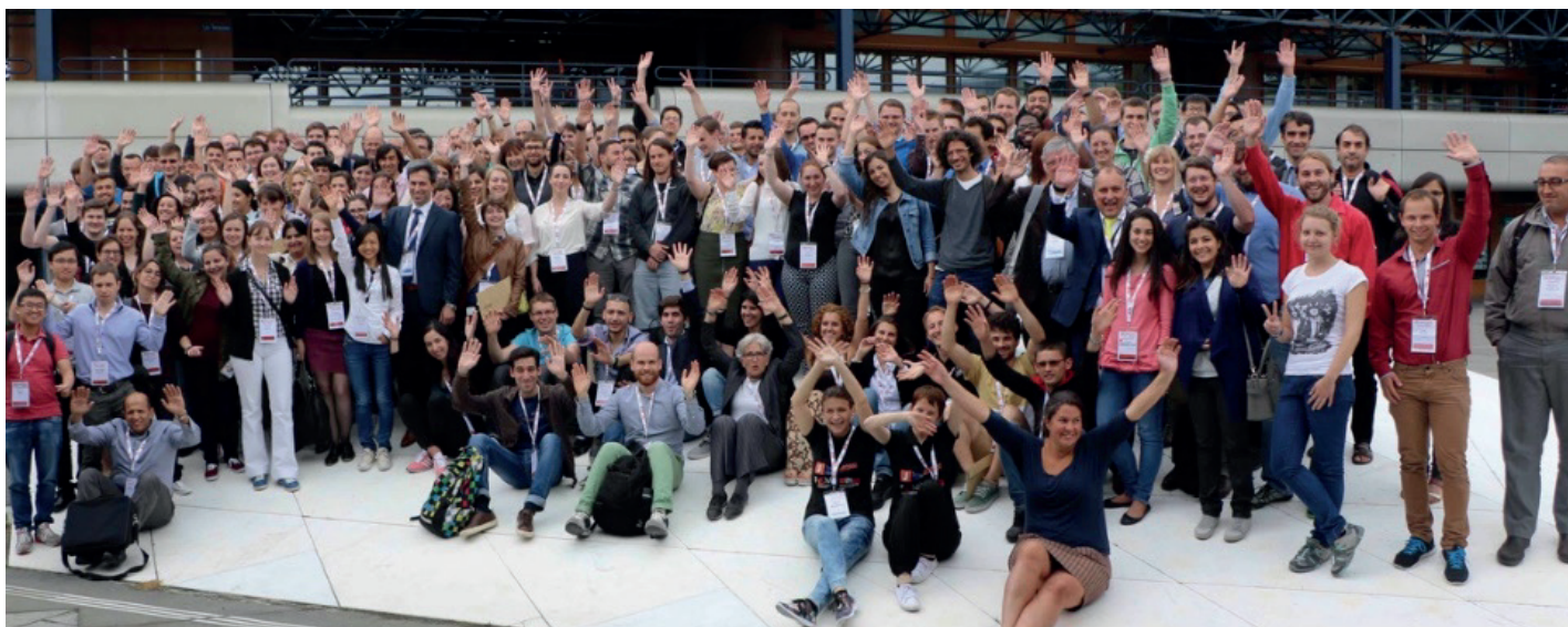
Delegates together at the last day of the conference