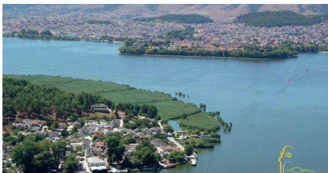
City of Ioannina: Panoramic View

The 6th Panhellenic Conference on Metallic Materials , will be held in Ioannina Greece on 7-9 December 2016. The Conference is Co-organized by the Laboratory of